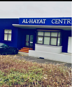
Al-Hayat Centre Unit 1, 4 Dukes Rd, Southampton, SO14 0SQ