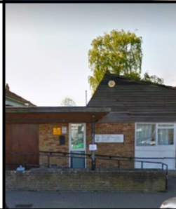
Masjid Umar Al- Farooq Islamic Centre 195 Derby Road, Southampton SO14 0DZ