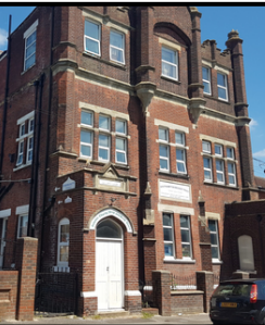
Abu Bakr Jamia Masjid Argyle Road, Southampton, SO14 0BR

If you want to integrate with the wider Muslim community of Southampton, do visit the local mosques here too.