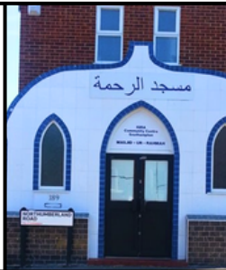
Masjid Ar-Rahmah 189 Northumberland Rd, Southampton, SO14 0EL