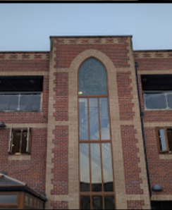
Masjid Bashir Ahmad 96-100 Portswood Rd, Portswood, Southampton, SO17 2FW