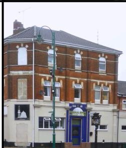
Shah Jalal Mosque and Islamic Centre 121 St Mary's Road, Southampton, SO14 0BL